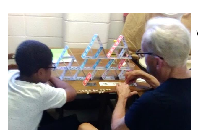
While some were making card houses, fish mobiles, and an extraordinarily high straw tower.