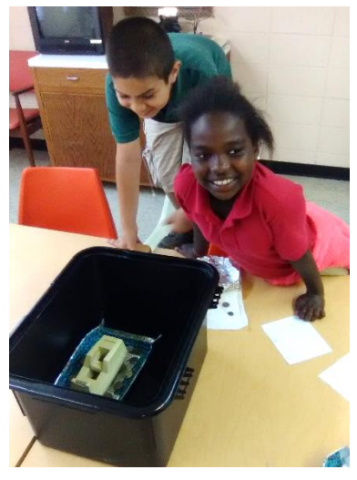
Some kids created boats from foil that floated on the water despite many coins and a tape dispenser in their hull!

All left Whiz Kids a little sad to leave for the summer, but very satisfied with a job well done, that day and all year long