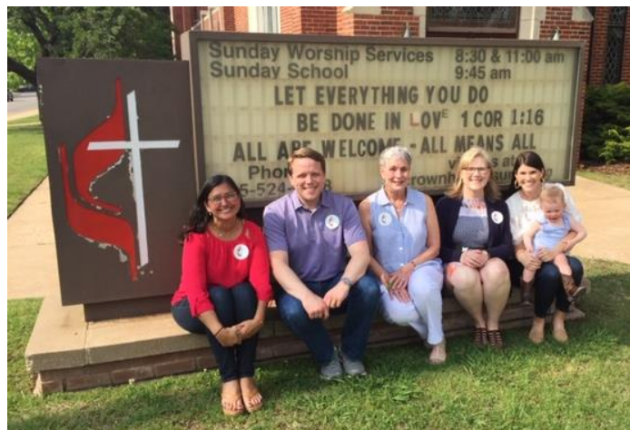
Members of the Reconciling Committee outside of Crown Heights UMC

"If we have a gay couple who wants to get married, we will surround them with our support and presence and help them work through all the specifics of their wedding in another location. And if we have a gay candidate for ministry come through our congregation, we commit to supporting and advocating for them through the Church's process."