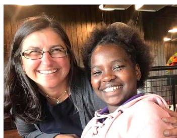
Pictures from May 2019: Left- Whiz Kids End-of-the-Year Pizza Party at Hideaway Right- Orr Family Farm, fun day for Whiz Kids