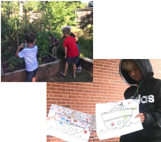
Pics of kids at our Mid-week Lesson, Thursdays at 10am

With the limitations of Covid, we continue to look for ways to connect with our children and youth.