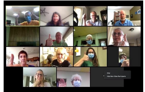
Picture: Tutors being trained on Zoom meetings on 9/10/20