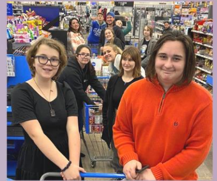
Youth shopping for Thanksgiving Bags