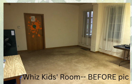
Whiz Kids' Room-- BEFORE pic