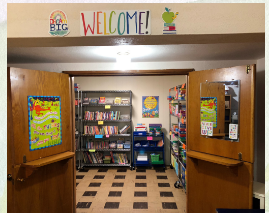
Safe Room, full of Whiz Kids' books

The final room in construction is the former Whiz Kids' room. On April 1, the students from OU will begin removing the old ceiling. We will work to replace the ceiling, paint, and get new flooring. Interestingly, we needed to empty out the books and Whiz Kids' supplies so we improved the old Tablecloth Room/old Bridal Lounge (what we are calling the Safe Room) next to the Fellowship Hall. Check out the transformed space. It is not just functional but looks great.