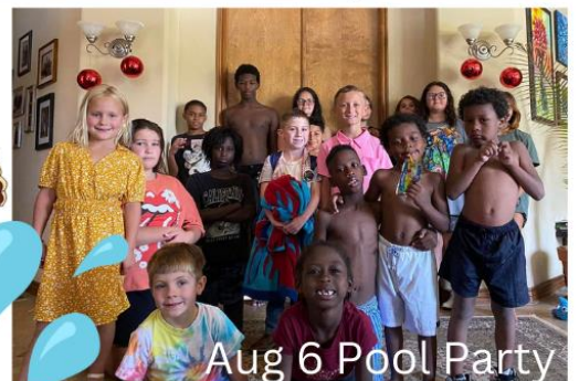
Aug 6 Pool Party