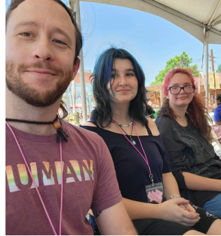
Sunday May 26, youth went to the Paseo Art's Festival

Join each Sunday at 10am for breakfast in the Fellowship Hall and a lesson in the Youth Room. Youth will attend 11am worship on the first Sunday of month (no phones). The other Sundays, youth will have a Bible lesson during worship.