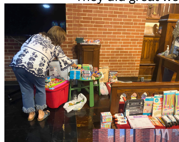
Pics: Our church bought supplies for our teachers and John Glenn Elementary School staff. And we hired these two to do yard work. They did great work.